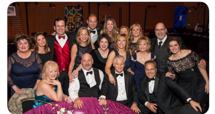
Supporters and staff had a great evening