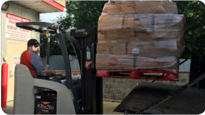
PICTURE ABOVE » A Costco employee loads more than 2000 pounds of chicken for St. Francis House.

COSTCO DONATES MEAT TO ST. FRANCIS HOUSE