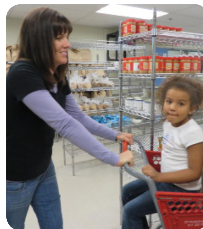
PICTURE ABOVE » Families can shop once monthly for a several-day supply of food at St. Francis House.

September is Hunger Action Month. Join the effort: donate, host a food drive, or volunteer. Visit cssalaska.org to learn more.