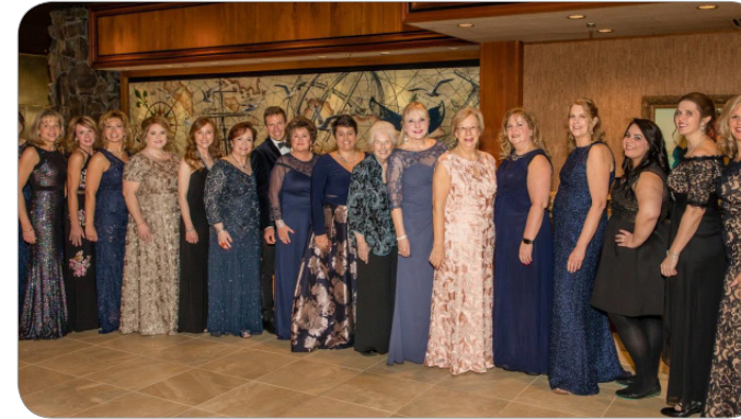
Members of the Charity Ball Committee